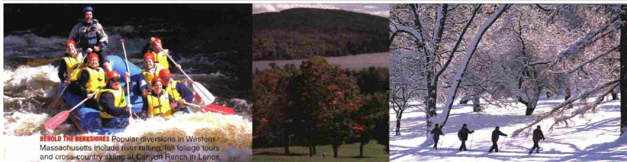
BEHOLD THE BERKSHIRES Popular diversions in Western Massachusetts include river rafting, fall foliage tours and cross-country skiing at Canyon Ranch in Lenox.

in the Berkshires. Visitors can be transported to Elizabethan England via Shakespearean performances or take in some lilting Broadway musicals.