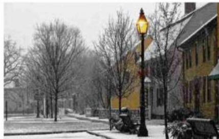
Wethersfield is always charming, but especially so during the holiday season.