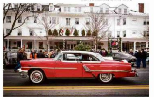
The Red Lion Inn in Stockbridge.