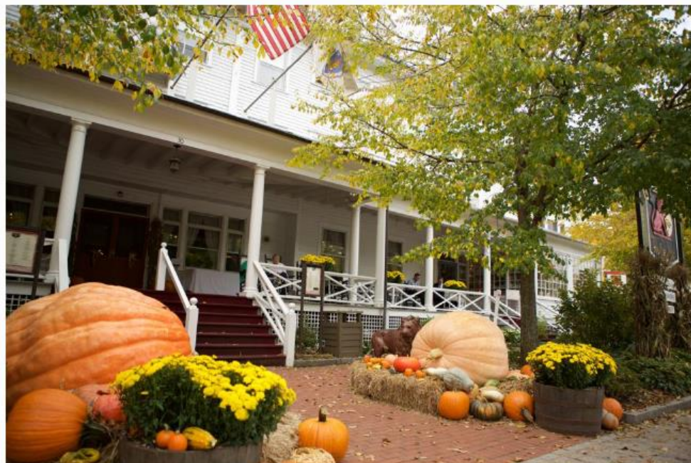
The historic Red Lion Inn has been providing food and lodging to guests for more than two centuries. ... [+]